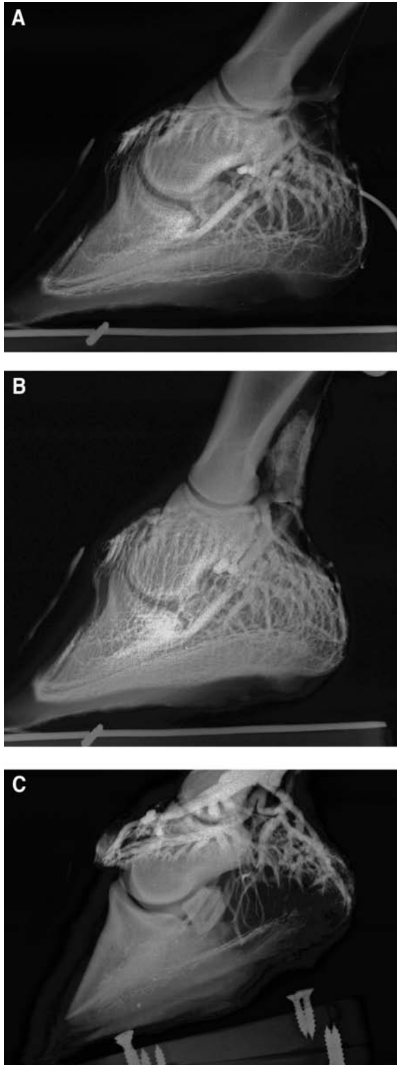
Fig. 3. (A) A 12-cm-wide Quarter Horse foot with only 10 ml of contrast injected. Gradual tapering of the vessels and areas with reduced fill such as these dorsal lamellar, coronary areas, and heel areas characterize inadequate volume of contrast. (B) The same foot after an additional 10 ml of contrast was injected. The appearance of inadequate volume should not be confused with that of the (C) classic sinker. There is minimal contrast tapering into the heel and terminal arch, but the major-

sels, circumflex vessels, and heel region are evaluated on the venogram. Their appearance is consistent in the non-pathologic foot and is repeatable over time in individual feet. f Different radiographic techniques allow visualization of both the subtle vessels of the solar papillae as well as the more radiopaque vessels in the terminal arch. The "late" lateromedial view images the contrast as it begins diffusing into the tissue, occasionally delineating an area of pathology.