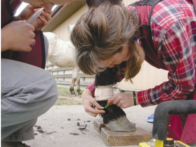
Fig. 1. Positioning for catheterization of the lateral palmar digital vein of the right forelimb.

of the palmar digital vein. Stand the horse on radiograph blocks so that the primary beam is at the level of the palmar surface of the distal phalanx, and position the radiograph machine for a lateromedial view. Apply a radiopaque dorsal wall marker.