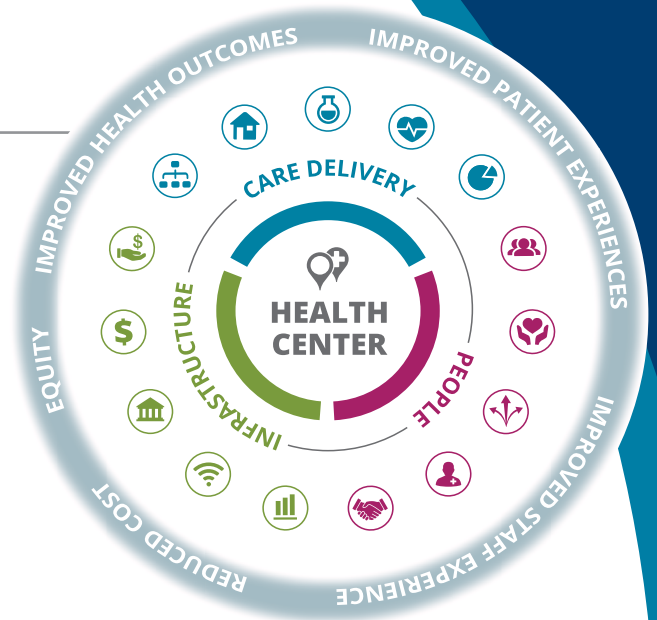
Value Transformation Framework Advancing Health Centers toward the Quintuple Aim

The Framework and supporting resources guide health centers to achieve value-based care.